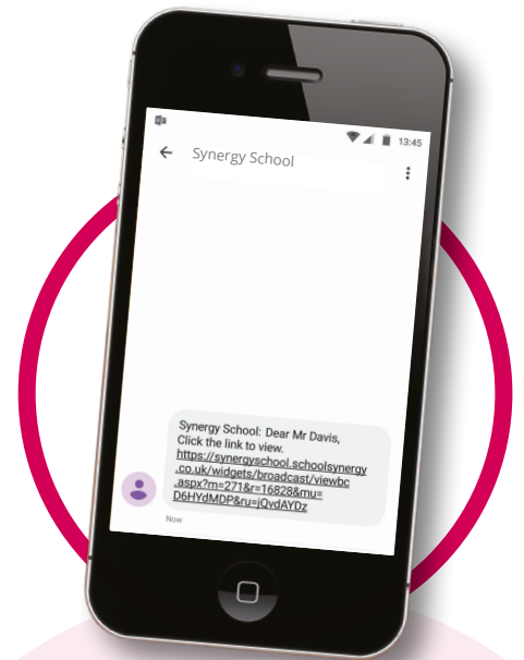
A text is received from school

Take a 2 minute tour of the Parent Portal https://vimeo.com/506028955/89e980e50f or scan this QR code with your phone