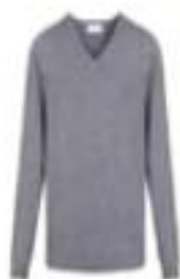
Grey school sweater