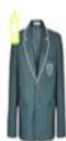
Green school blazer